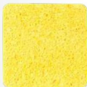
Approx. 3" x 3"