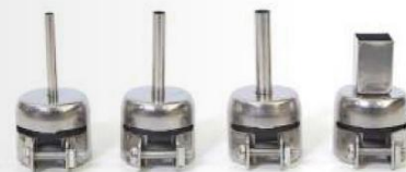
Various Types of Nozzles Available