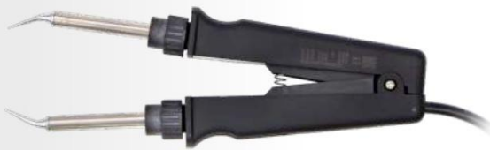
Optional Accessory for use with Models 936 ESD or 937